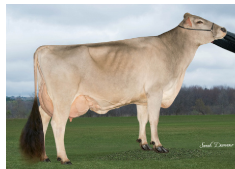
Jordy's Dam: Trout Run Driver Jan P 2nd Lactation