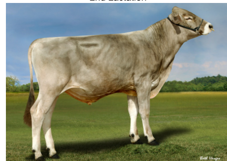
Trout Hilltop Jordy ETV

Sire: Victor-ET P Dam: Trout Run Driver Jan P 2/00 365d 3x 27,340m 5.1 1,389f 3.9 1,059p MGS: Hilltop Acres H Driver-T TM MGD: Trout Run Jill P ET 4/00 2x 305d 19,210m 4.8 922f 3.3 631p